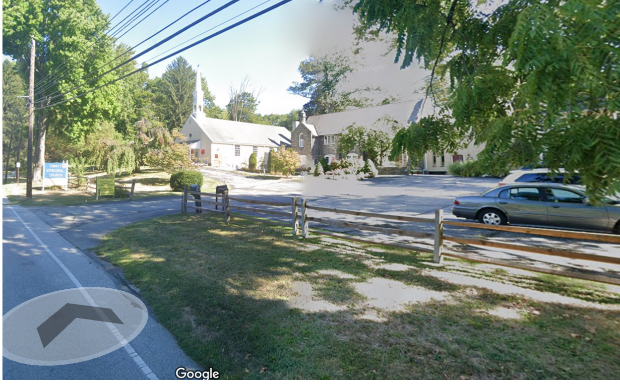
Entrance to Packer Hall is located near the steepled church building.

From Trinity Lane - handicapped parking only